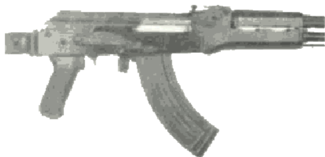
Fig. 2 The Safety Lever in the "FIRE" position.