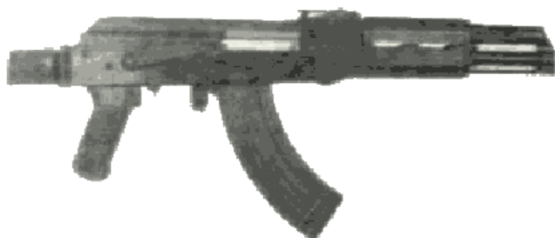
Fig. 1 The Safety Lever in the "SAFE" position.

Unlike most safeties, the safety on the AKS-762 SP has been positioned where it cannot be easily operated by right-handed shooters without first removing the index finger from the trigger. IT IS STRONGLY RECOMMENDED THAT ALL SHOOTERS, LEFT - OR RIGHT-HANDED, KEEP THEIR FINGERS AWAY FROM THE TRIGGER GUARD WHEN OPERATING THE SAFETY IN ORDER TO AVOID THE POSSIBILITY OF ACCIDENTAL DISCHARGE.